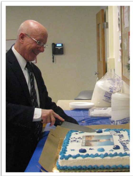
Cutting his retirement cake!