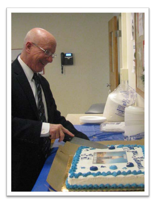
Cutting his retirement cake!