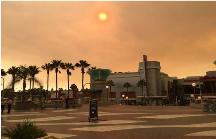
Long Beach, CA