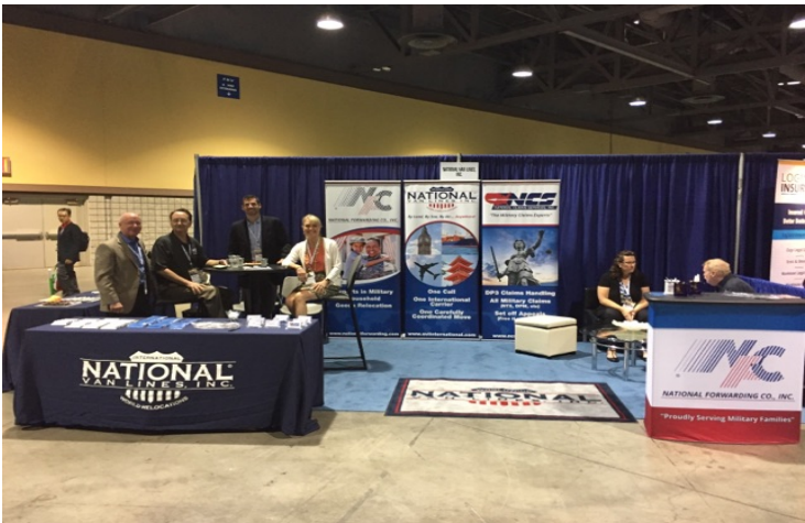
National's Convention Booth