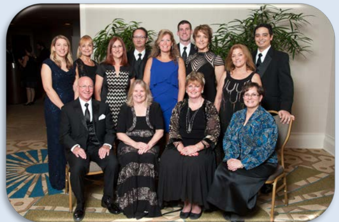
NFC Staff at the Gala Awards Dinner