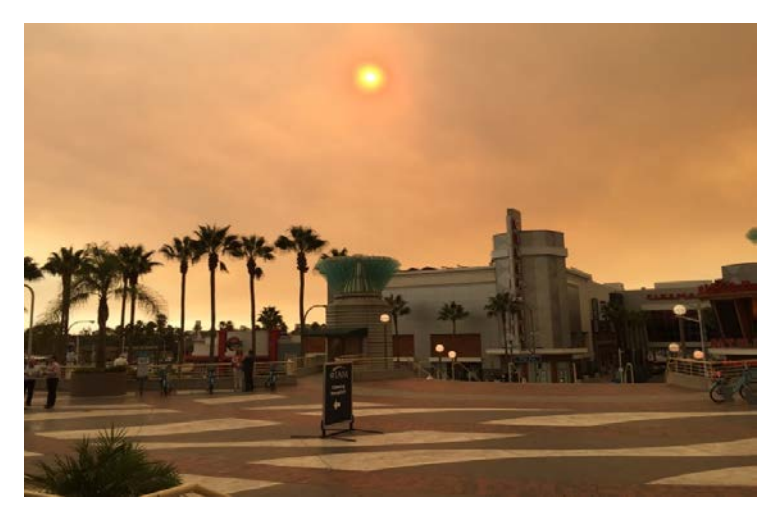
Long Beach, CA

Charting a New Course Long Beach, CA October 9-12, 2017