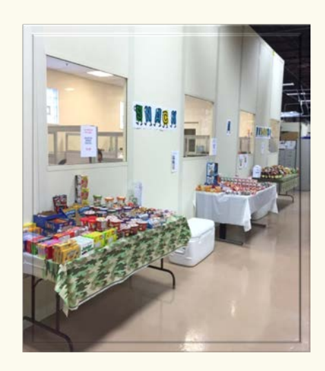
SNACK-A-PALOOZA Three full tables with snacks plus a cooler with cold drinks!