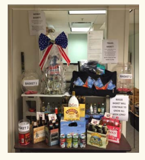
Prizes for our raffle included: Over $300 in cash, $600 in Southwest gift cards with travel accessories, and the ever popular booze basket.

Honor Flight Chicago is an organization that takes World War II vets to Washington, D.C. for a day of remembrance. We continued our summer fundraising efforts for Honor Flight with a BBQ, snack table, and huge raffle. The total raised for this event is $2078.00