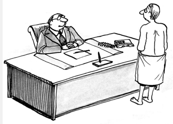
"I take it the Change Seminar stripped you down to your vulnerabilities."

Looming west coast port shutdown speculation has many in the Industry concerned about the impact this could potentially have on Code 4 shipments. As of the publication of this newsletter, the ports are now open and issues have been settled. However, there is a considerable backlog of shipments and it will take time to alleviate.