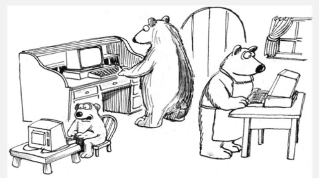
"Someone's been messing around at my work station, too!"